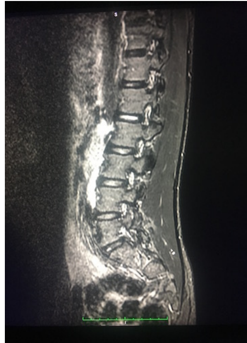
Figure 1: MRI demonstrating bilateral pars defects at L1 and L5 with possible slight L5/S1 listhesis.

hip extension during the acceleration phase, impact and follow through.